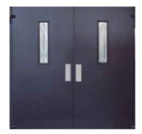
Manual swing landing door (standard)