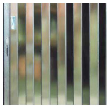
Galvanised manual shutter landing gate