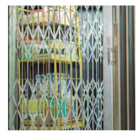
Galvanised car picket gate